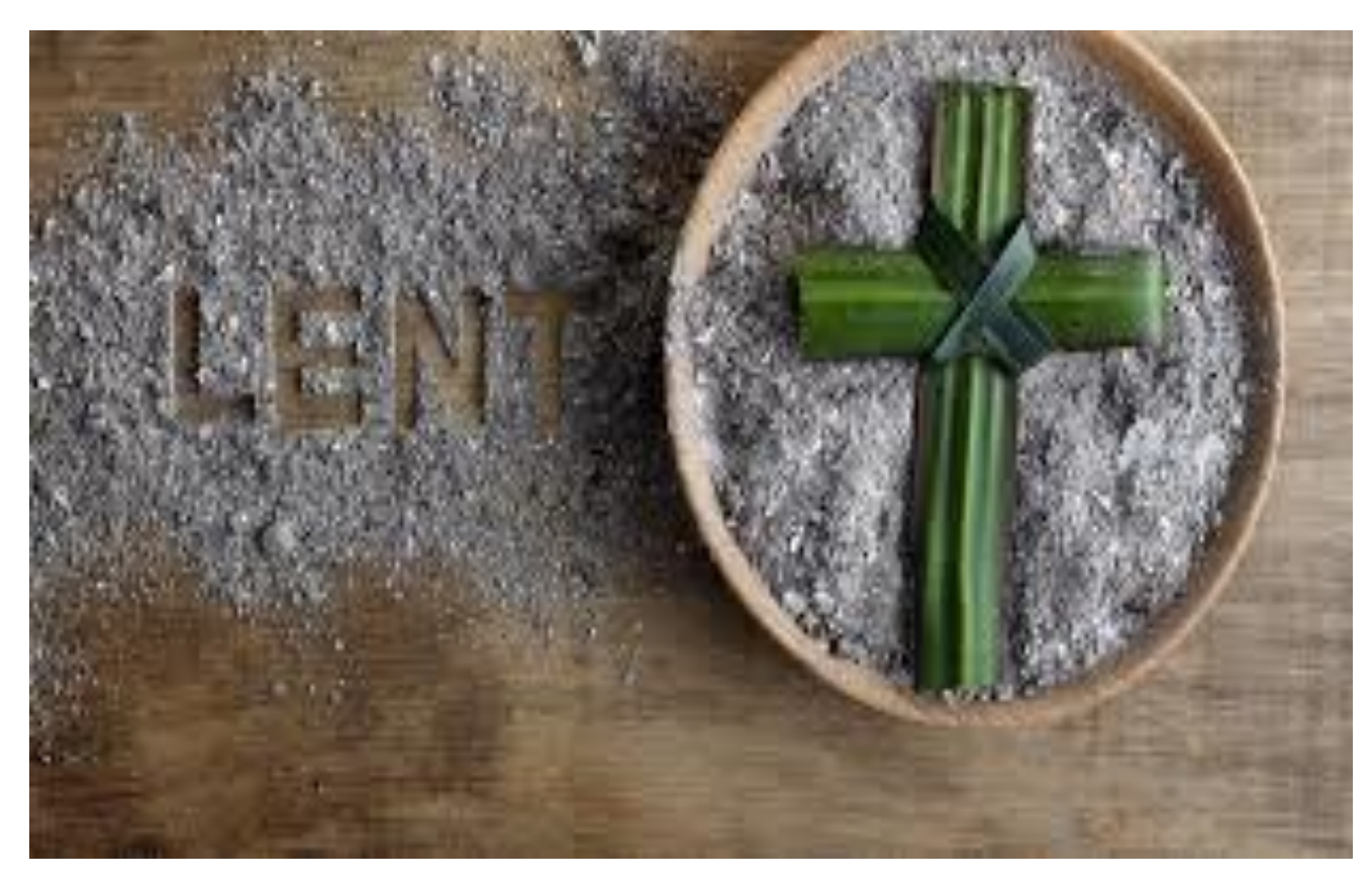
Week of March 17<sup>th</sup>

105 West Main Street, Bedford, Virginia From 1844 to 2024 (180 Pears)